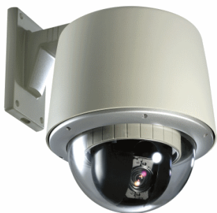
Outdoor Housing w/ Fan & Heater